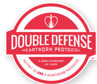
Double Defense against heartworms